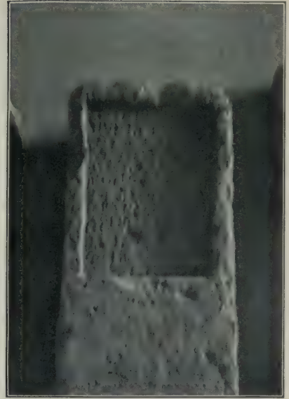
ONE OF THE IOVILAE-DEDICATIONS, NOW IN THE NAPLES MUSEUM. OUR NO. 29