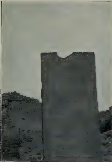
INSCRIPTION PAINTED IN RED ON THE FRONT OF THE "HOUSE OF PANSA" AT POMPEII. OUR NO. 15.