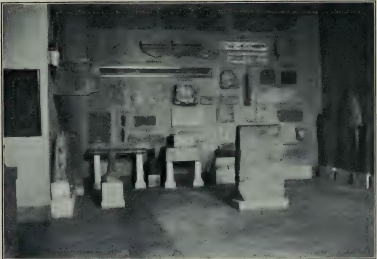
ALCOVE OF OSCAN INSCRIPTIONS IN THE NAPLES MUSEUM.