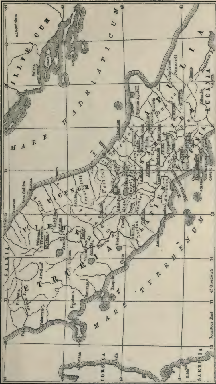
MAP OF CENTRAL ITALY

Showing places from which come inscriptions or coins in Oscan, Umbrian, or any of the minor Oscan-Umbrian dialects. The names of towns from which we have inscriptions are underscored, while the names of towns from which we have coins are marked with a line above. A few Oscan inscriptions come from places further south than the map shows, namely Tegeanum in southern Lucania, Vibo Valentia in Bruttium, and Messana in Sicily.